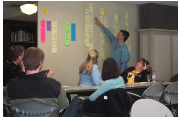
Figure 6 . A parish team organizes improvement ideas to determine which have the greatest impact while not overtaxing the community's ability to put them into practice.

Identify areas of disagreement. Some may find the parish to be strong in a particular practice or behavior. Others may see it differently. Discuss these differences. Try to find the root causes of different views about an item. These discussions will likely reveal a clearer understanding of how people view the parish.