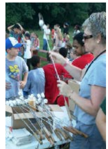
Figure 3 Healthy parishes socialize and celebrate.

A new commandment I give to you: that you love one another, as I have loved you, so you must love one another. By this all will know that you are My disciples, if you have love for one another." John 13:34-35