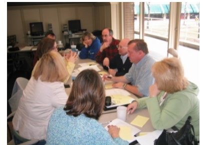
Figure 1 A primary value of the inventory may be as a framework for conversation and dialogue.

The model then is one view but far from the only view of healthy Orthodox parish life. It is, we hope, a starting point for a valuable parish conversation.