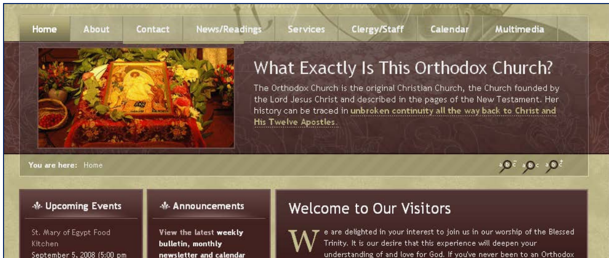
Figure 4 Parish websites are important tools for communicating awareness of a parish.