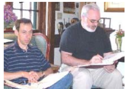
Figure 2 A parish ministry group develops plans for upcoming year.