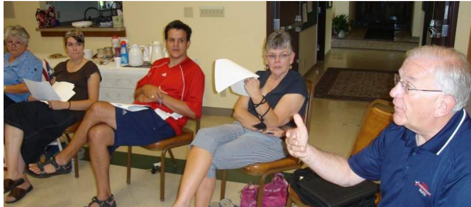
Figure 5 A primary value of the inventory may be as a framework for conversation and dialogue. Here a parish group discusses one section of the inventory model.

Pastoral transitions - Prior to placing/receiving new pastors, parishes may want to assess their status, where they desire to head and to openly share these ideas with new clergy.