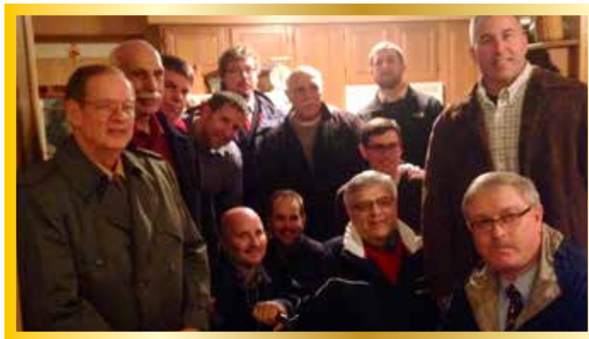
BERWICK • On December 24 2014, the men of Holy Annunciation Orthodox Church's Choir visited parishioner's homes to sing Christmas Carols.