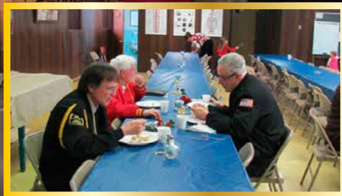
MOUNT CARMEL • Several members of the Mt. Carmel VFW joined St. Michael's for services on November 11th in commemoration of Veterans Day. A lunch was provided by the parish to those in attendance.