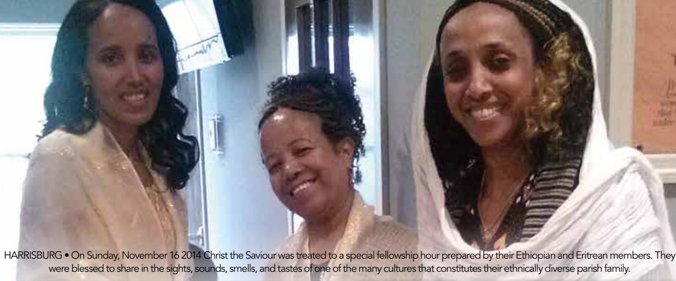
HARRISBURG • On Sunday, November 16 2014 Christ the Saviour was treated to a special fellowship hour prepared by their Ethiopian and Eritrean members. They were blessed to share in the sights, sounds, smells, and tastes of one of the many cultures that constitutes their ethnically diverse parish family.