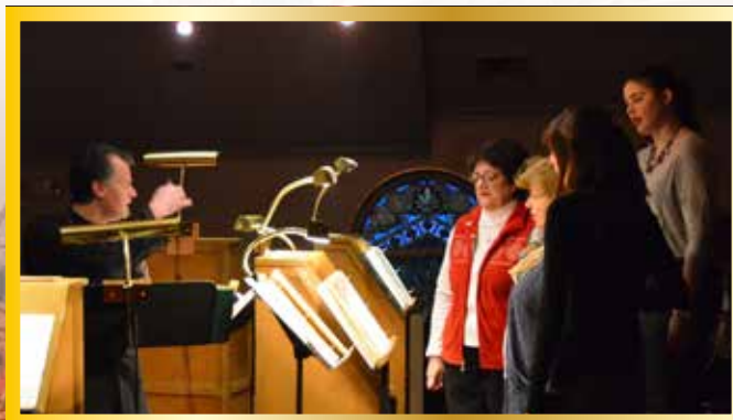
EDWARDSVILLE • On Saturday, December 20, 2014, the Choir of St. John the Baptist Orthodox Church presented a Nativity Concert featuring traditional hymns and many Russian standards.