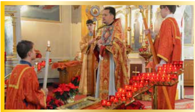
EDWARDSVILLE • St. John the Baptist Orthodox Church welcomed parishioners, guests and visitors to Divine Liturgy on December 25, 2014. Those gathered were treated to Nativity selections during dismissal.