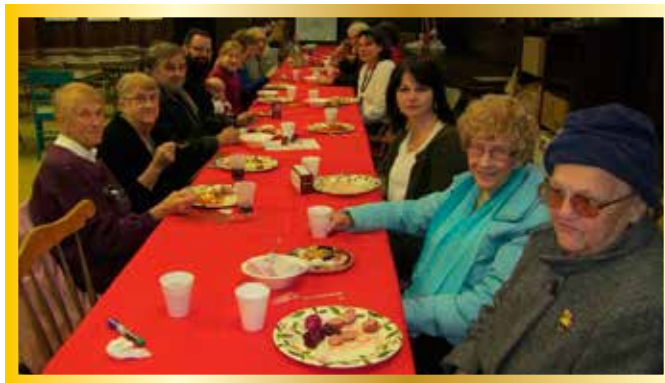
MOUNT CARMEL • On Sunday, December 14 2014, following Divine Liturgy, the parishioners of St. Michael's Orthodox Church gathered in the church hall to hold a Sing Along. Many seasonal favorites were sung in anticipation of the Feast of the Nativity.