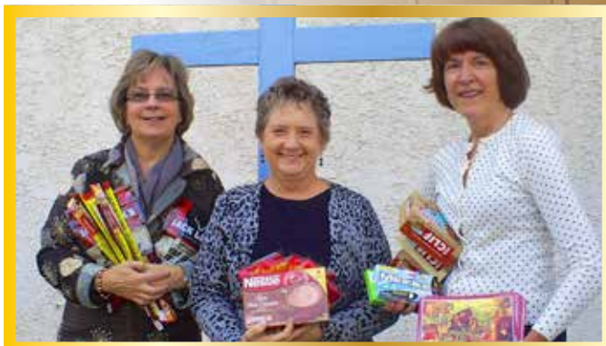
GRADYVILLE • St. Herman of Alaska parishioners gathered enough items to remember, thank, and to send to two Army platoons serving in Afghanistan.