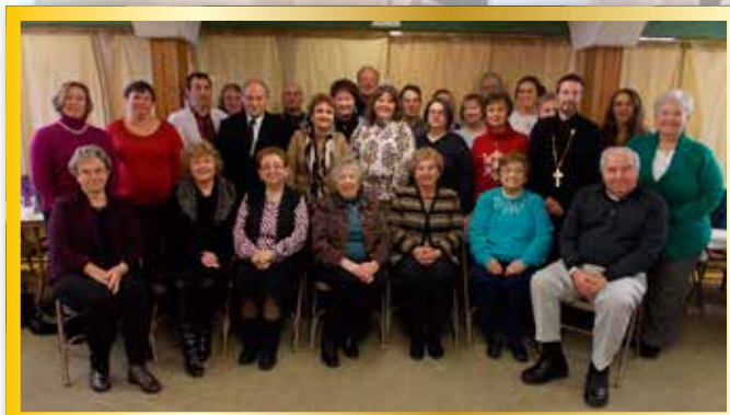
BERWICK • On Sunday, January 25th, Holy Annunciation Ladies Organization (HALO) hosted their annual Winter Fiesta following Divine Liturgy.