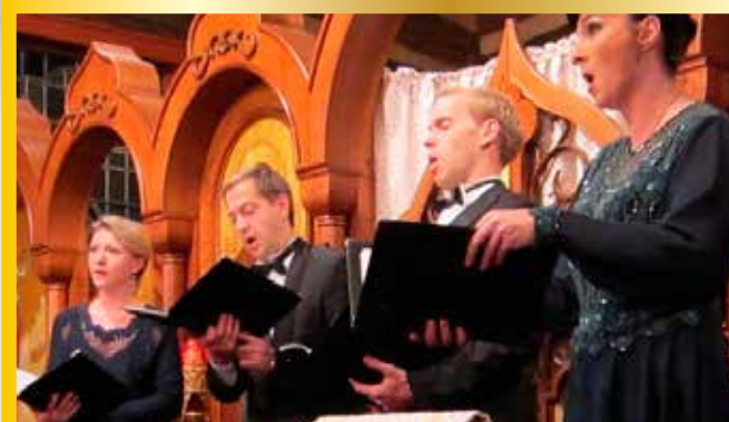
WILLIAMSPORT • On October 8, 2014, the choral ensemble from St Petersburg Russia -- LYRA -- performed a concert of Russian Orthodox liturgical hymns and traditional folk songs.