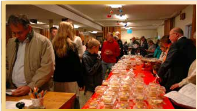
HARRISBURG • From October 4th - 5th Christ the Saviour held its annual Slavic Food Fest, welcoming hundreds of our parishioners, neighbors and friends to enjoy a "taste" of one of the many cultures that constitutes our ethnically diverse community.