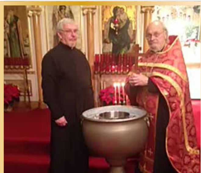
The faithful of St. Vladimir's Orthodox Church gathered for the feast of Theophany. Following Divine Liturgy, the celebrants travelled to Loyalsock Creek and witnessed the Blessing of the Waters there.