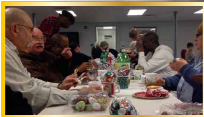
EDWARDSVILLE • On Saturday, December 20, 2014, the Sunday School of St. John the Baptist visited the local Veteran's Center to share a home made holiday meal and Orthodox fellowship.