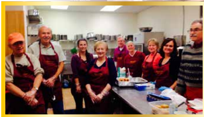
STROUDSBURG • Holy Trinity hosted a Thanksgiving Soup Kitchen dinner on November 14, 2014 serving approximately 40 meals.