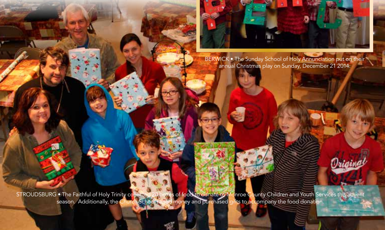
STROUDSBURG • The Faithful of Holy Trinity collected 20 boxes of food to donate to Monroe County Children and Youth Services this advent season. Additionally, the Church School raised money and purchased gifts to accompany the food donation.