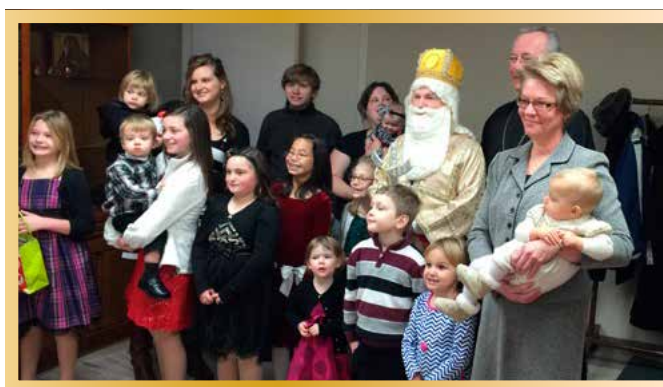
FRACKVILLE • On Sunday, December 7, 2014, the parishioners of Holy Ascension Orthodox Church in welcomed "St. Nicholas" after Divine Liturgy.