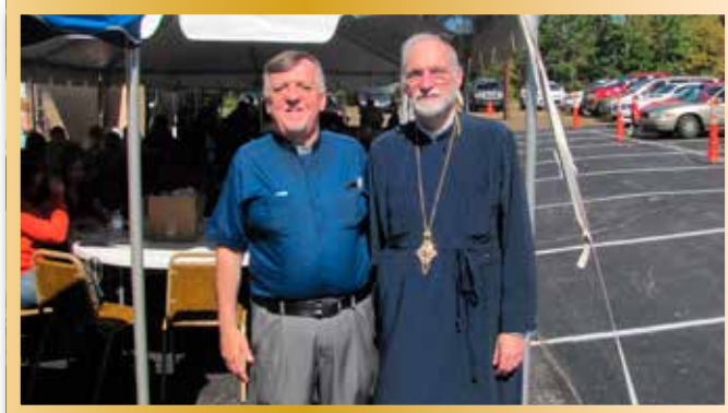
JERMYN • The Fifth Annual Christmas in September and Classic Car Show was held from September 26-28 at St. Michael's Center. A record crowd of nearly 1,300 people attended on Sunday afternoon.