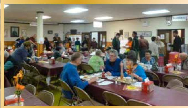
PHILADELPHIA • On November 1, 2014, St. Stephen Cathedral held their annual Fall Food Festival. A variety of ethnic food was prepared by parishioners and enjoyed by many visitors from the neighborhood.