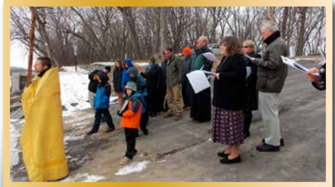
BERWICK • On Sunday, January 11, 2015, the faithful of Holy Annunciation celebrated the feast of Theophany with the blessing of the Susquehanna River at the Berwick Test Track.