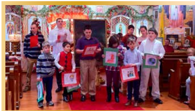
GRADYVILLE • St. Herman of Alaska Sunday School presented it's annual Yolka on January 4, 2014.