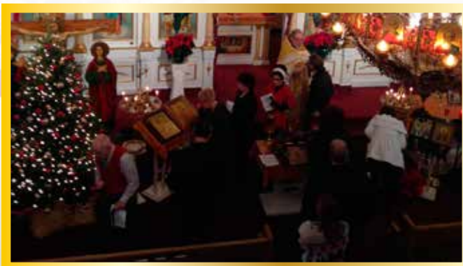
OLYPHANT • St. Nicholas Orthodox Church celebrated the Feast of the Nativity on December 25, 2014. A light meal was served in the parish hall following the Divine Liturgy.