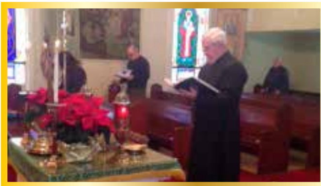
On December 25, 2014, the faithful of St. Vladimir's Orthodox Church celebrated the Feast of the Nativity. Parishioners gathered on Christmas Eve to share Holy Supper.