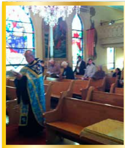
FRACKVILLE • On Sunday, October 26, 2014, the faithful of Holy Ascension Orthodox Church gathered for an Akathist to the Mother of God, Healer of cancer service.