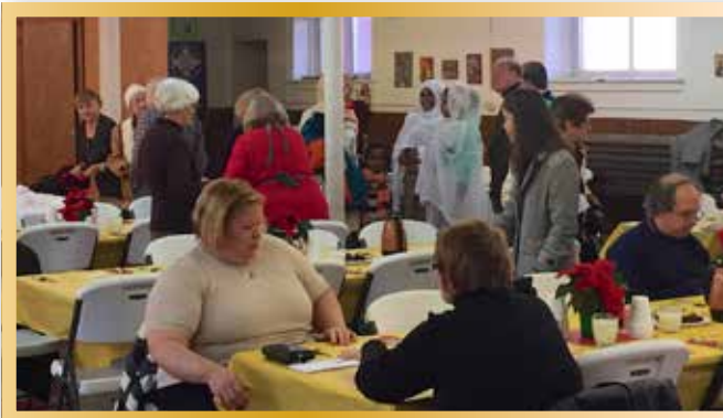
EDWARDSVILLE • On Sunday, December 7 2014, the FOCA Chapter of St. John the Baptist Orthodox Church in Edwarsville, PA held their annual Spaghetti Dinner.