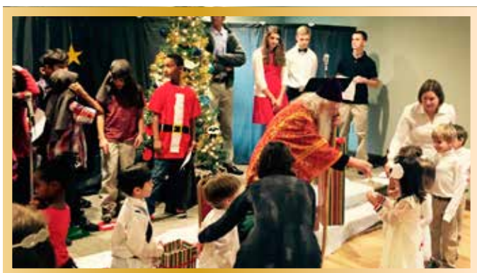
HARRISBURG • On Sunday, December 14th the parish Church School at Christ the Saviour held its annual Nativity Program.