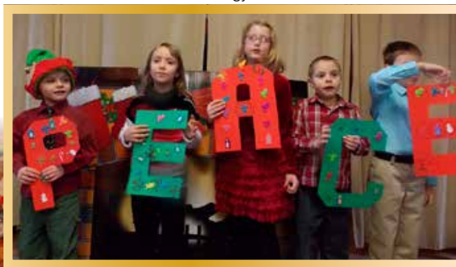
BERWICK • The Sunday School of Holy Annunciation put on their annual Christmas play on Sunday, December 21 2014.