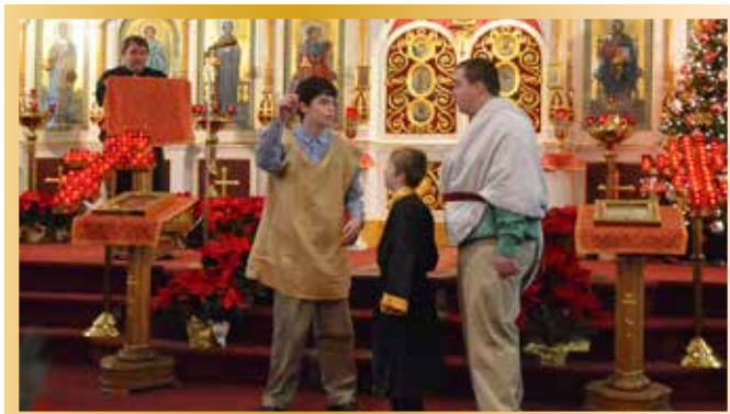
EDWARDSVILLE • On Sunday, January 4, 2015, the Sunday School of St. John the Baptist Orthodox Church held its' annual Nativity celebration for the Parish.