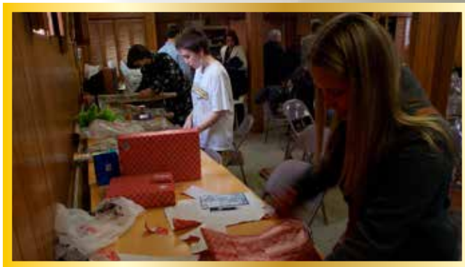
BERWICK • The teens of Holy Annunciation sponsored a needy family for the holiday season. They went shopping for the family and wrapped gifts after church to be sent out.